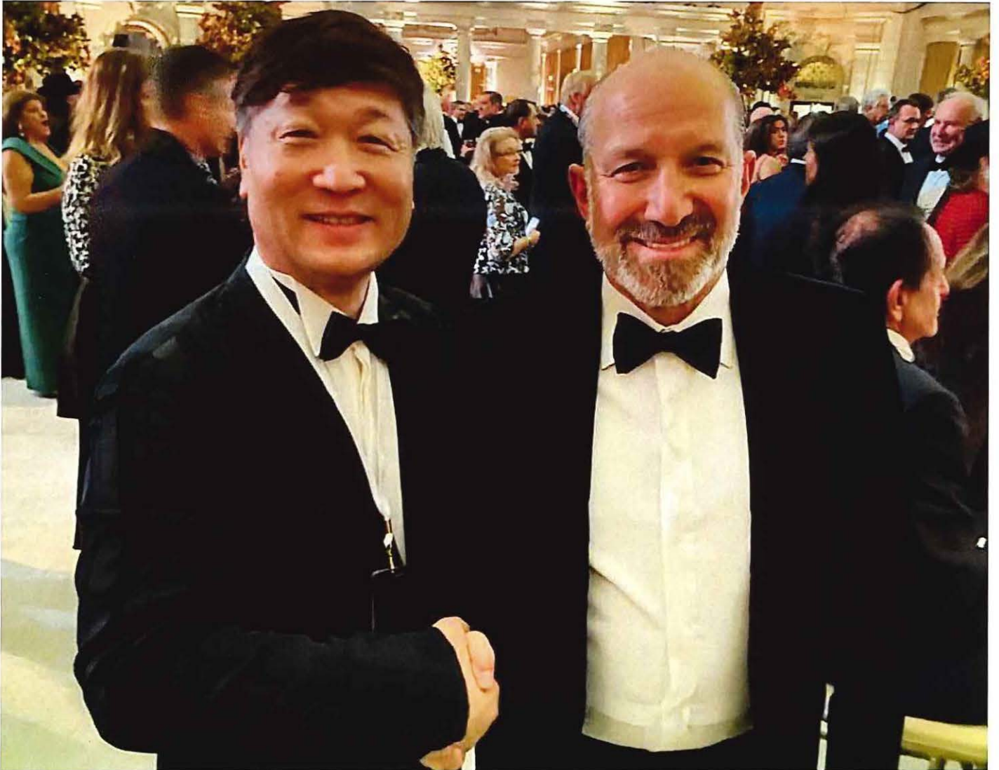
1-20-2025 Howard Lutnick(Nominee). Secretary of the Commerce Department on presidential Inauguration Day, Starlight Ball, Washington D.C