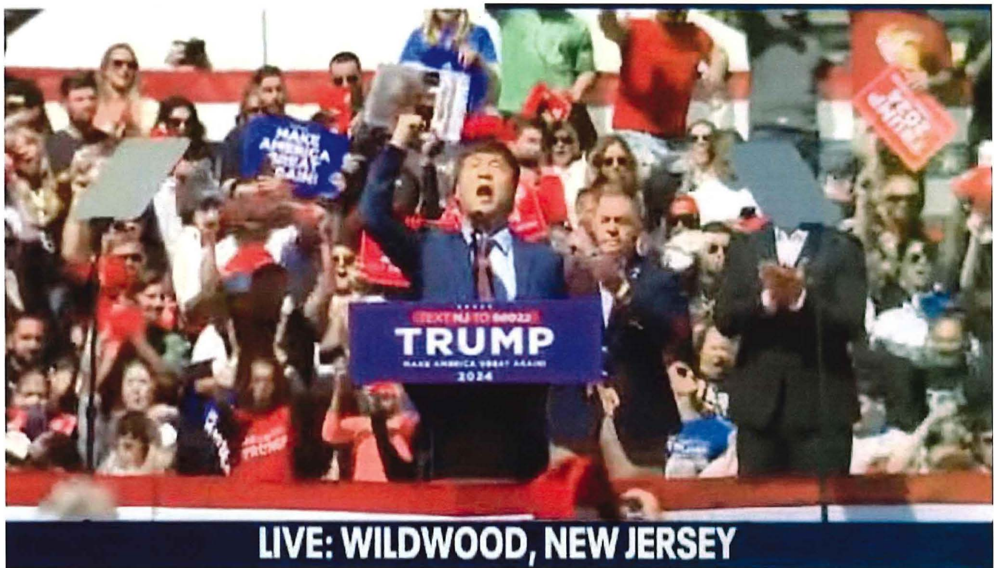
5-11-2024 Trump's Rally at Wildwood, NJ