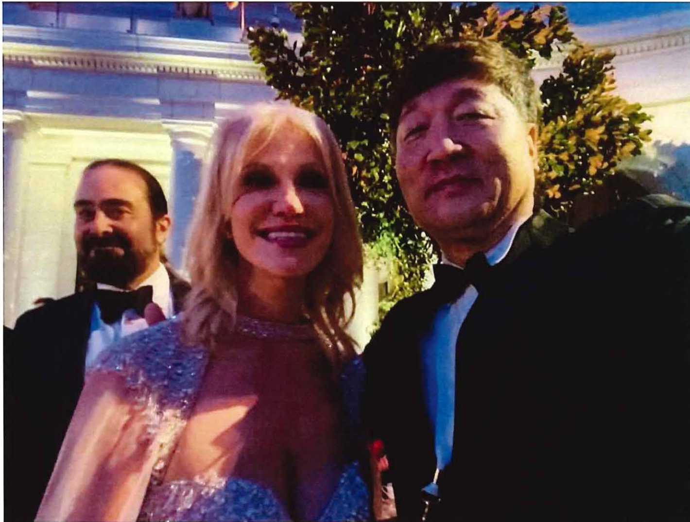
1-20-2025 Kellyanne Conway, Senior counselor to the President Trump,, at the Starlight Ball, Washington D.C