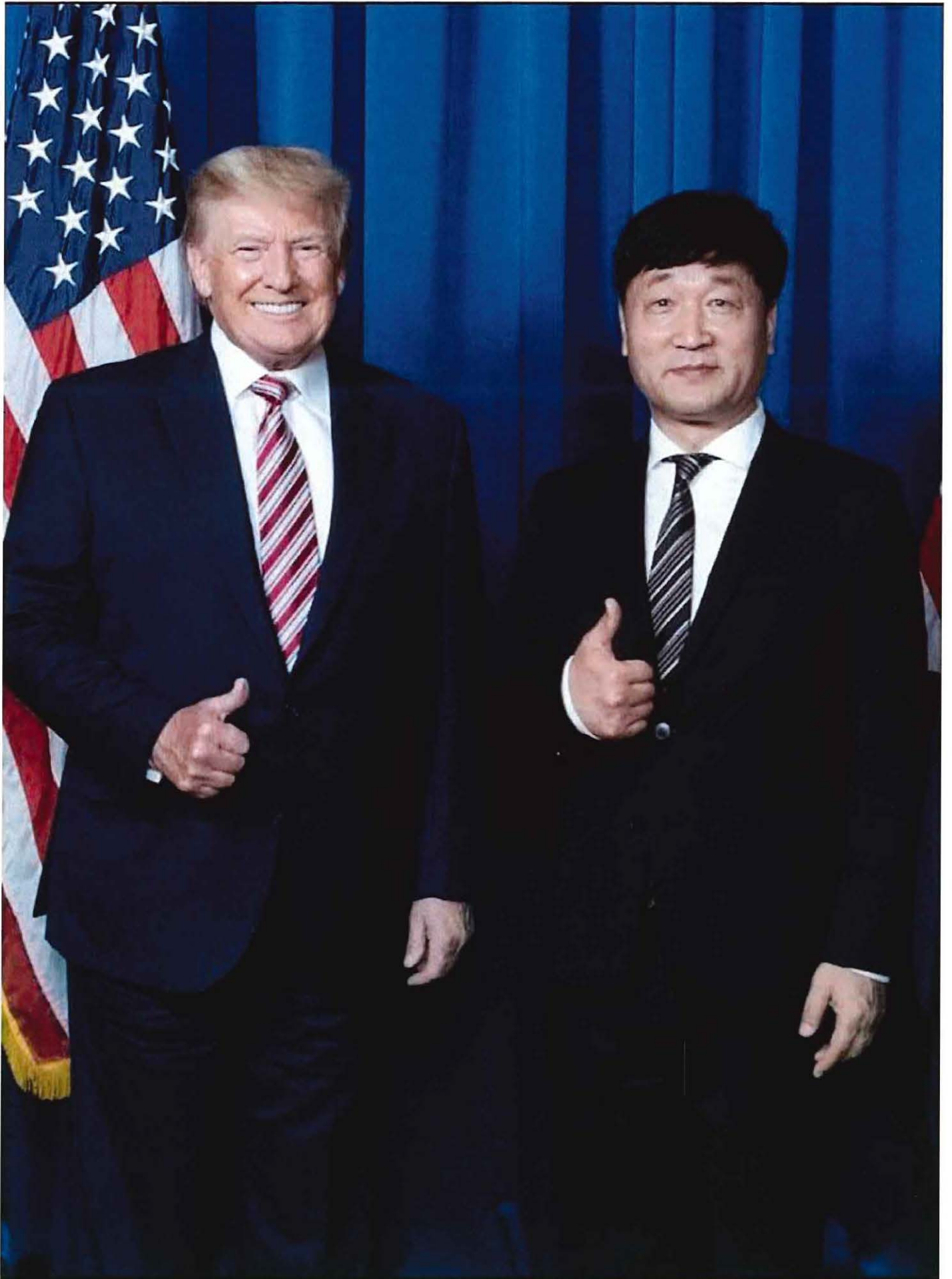
12-20-2022 at Mar-a-Lago, Florida, U.S.