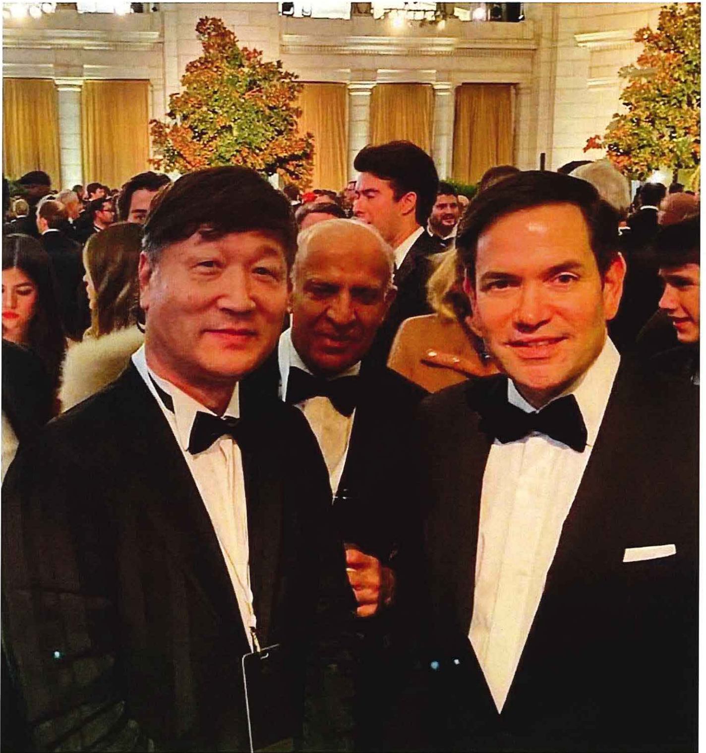
1-20-2025 Mike Rubio (Nominee). Secretary of the State Department on presidential Inauguration Day, Starlight Ball, Washington D.C