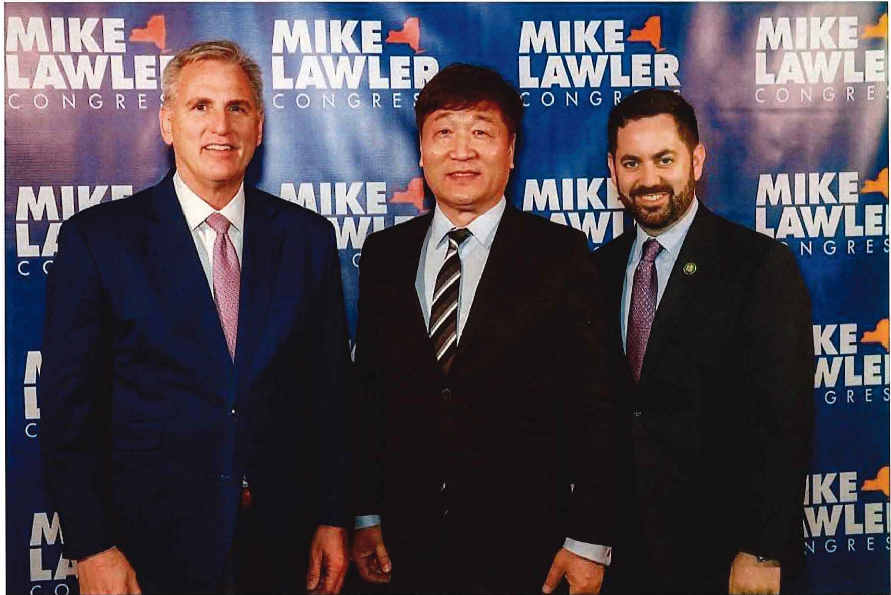
3-5-3023 The House Spesker Kevin McCarthy and Congressman Mike Lawler